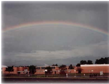
Paramus High School